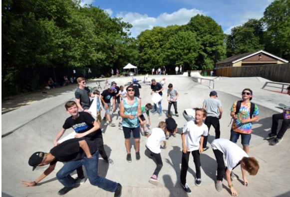
The Bowl opening event.

This is the culmination of years of hard work from young people in Calne and the working groups around them. The event was hosted by Calne Summer Festival and saw over 200 people, young and older at the bowl over the day. This event also reached a need for young people who had asked for more holiday activities and youth specific activities at town events.